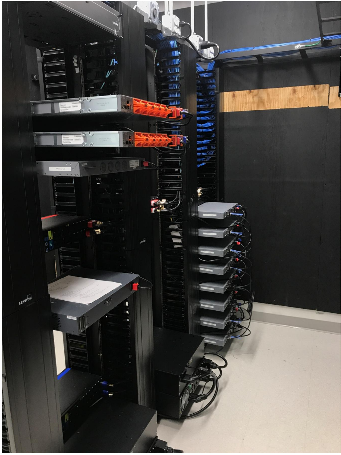
Typical Cable Management Photograph Example 003