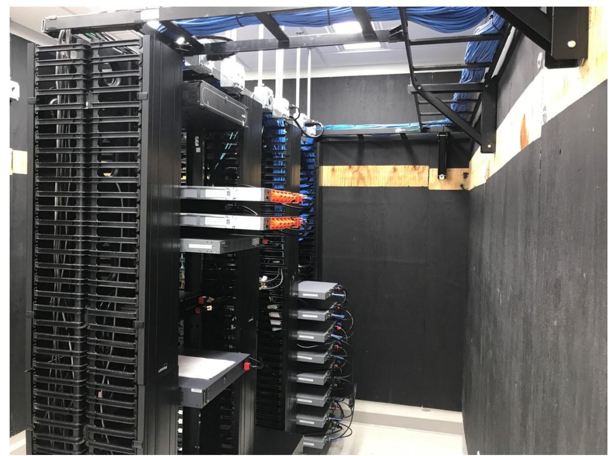
Typical Cable Management Photograph Example 005