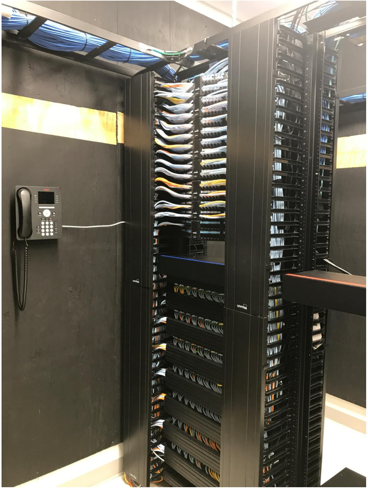
Typical Cable Management Photograph Example 002