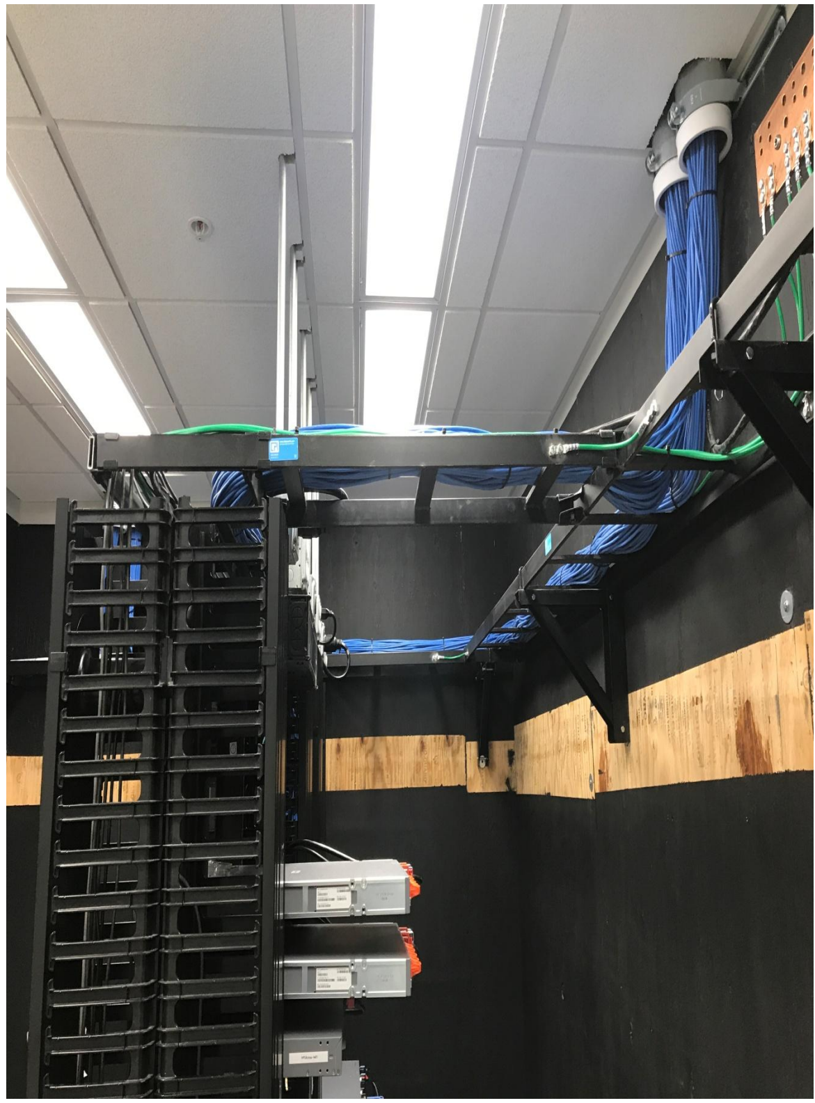
Typical Cable Management Photograph Example 001